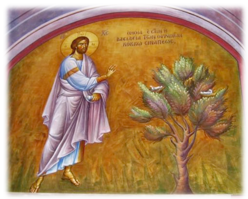
Jesus Curses the Fig Tree Church of Saint Andrews, Patras, Greece